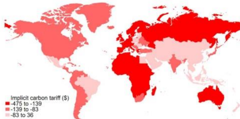
Figure 2: Implicit Carbon Tax on Traded Goods by Economy